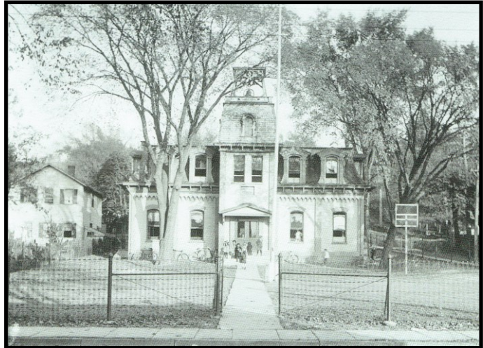
CASTLETON ON HUDSON, NEW YORK

There is no charge for this service to our residents.